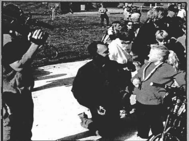
Tour 'de Tykes & Tour 'de Tiny Tykes, October, 2008